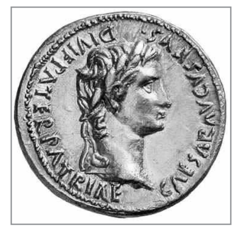
Fig. 1.3. A gold aureus, minted ca. 13-14 C.E., depicting Augustus as "son of God."

it contains over 250 stories about the gods and their deeds. What is telling about Metamorphoses is that the form of Ovid's poem is what, in biblical scholarship, we call an aretalogy. That is, it is a collection of miraculous acts and deeds that reach their climax in the divination of the person who is the collection's main focus. Another example, according to many New Testament scholars, is Mark 4:35—6:6, which may be a portion of a collection of Jesus' wondrous acts culminating in the miraculous feeding of the multitude. In Ovid's case, the wonder-worker is Julius Caesar, who died just a year before Ovid's birth. In other words, Ovid is making case in aretalogical form that the emperor has been elevated to the status of a god.