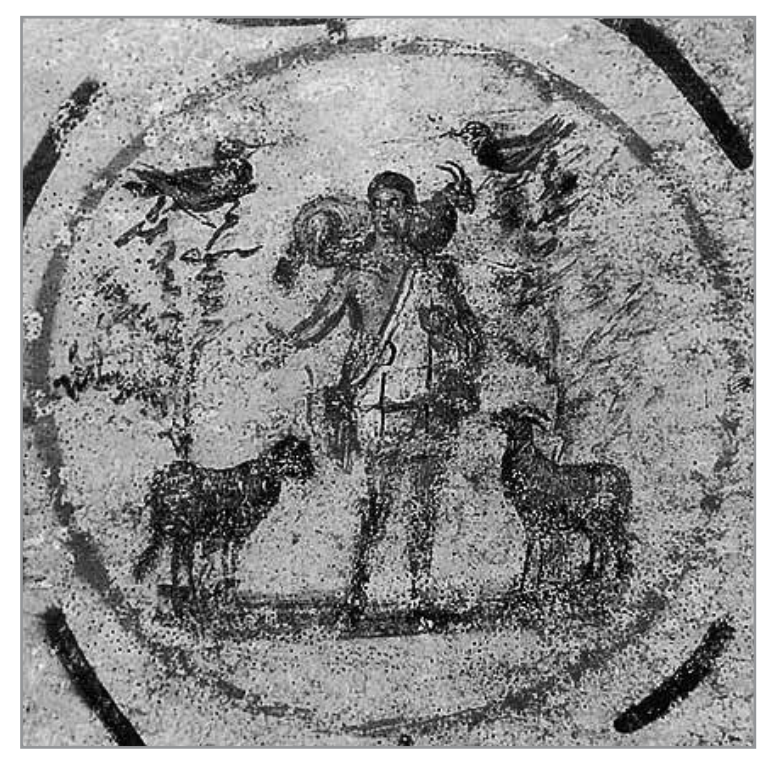
Fig. 1.0. Christ as good shepherd; third-century fresco from the Catacomb of St. Callistus, Rome.