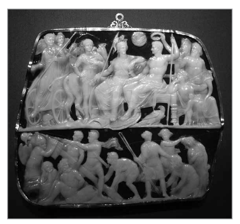
Fig. 1.2. Augustus (center right) is depicted as a divine being, seated among the gods in heaven, in the Gemma Augustea, onyx, first decades of the first century C.E. Kunsthistorisches Museum, Vienna.

The custom of voting divine titles to living rulers was common in the eastern Mediterranean regions, where there were extremely ancient and powerful traditions of divine kingship, especially in Egypt. The famous Rosetta Stone, discovered near one of the mouths of the Nile in 1799, contains a lengthy announcement in flowery Egyptian style proclaiming the divinity of a Greek king of Egypt, Ptolemy V Epiphanes